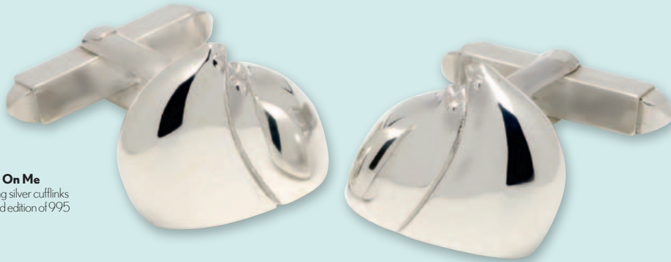
→ Lean On Me Sterling silver cufflinks Limited edition of 995 £125