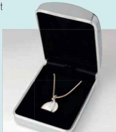
↓ Lean On Me Sterling silver necklace Limited edition of 995 £89